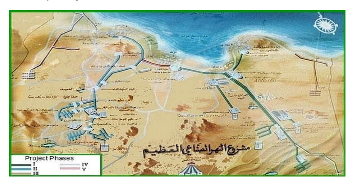
Figure 4. Schematic map of the project. Designed.

In October 1983 the General People's Congress held an extraordinary session to draft the resolutions of the People's Congresses, which decided to fund and execute the Great Man-Made River Project, and on August 1984 was the commencement of the construction of the Great Man-Made River Project. (Fig 4).