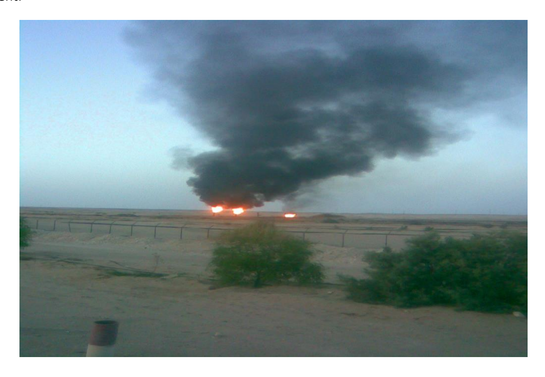
Flare of Zallah oilfields at Sunset time

Libya is among the major oil exporting country in Africa and its economy is heavily dependent on oil production. It has several oilfields all over Libya. Flaring is the common methods used in almost all oilfields in Libya for safe disposal of excess hydrocarbons. By burning the hydrocarbons there by converting them largely to carbon dioxide and water and therefore their environmental impacts is greatly reduced. Oil and gas industries consist of several different activities from exploration to production. All these activities have different impacts on the environment and the severity of the impact is greatly depends on the nature of activities and types of pollutants emitted. One of the major impact from oil and gas industries is the atmospheric pollution, where air pollutants are emitted to the air. Although most of the oilfields are located in the desert which makes the impact almost localized in uninhabited area, A complete picture on the quality status of the atmosphere requires an extensive analysis monitoring programme should be done on a daily basis within the major cities and in particular at the surrounding area of the industrial plants in order to safe guard and protect the environment. The air pollution is not yet a major problem in almost all the Libyan Cities due to the fact of low emission and for the cities being open which makes dilution is more efficient.