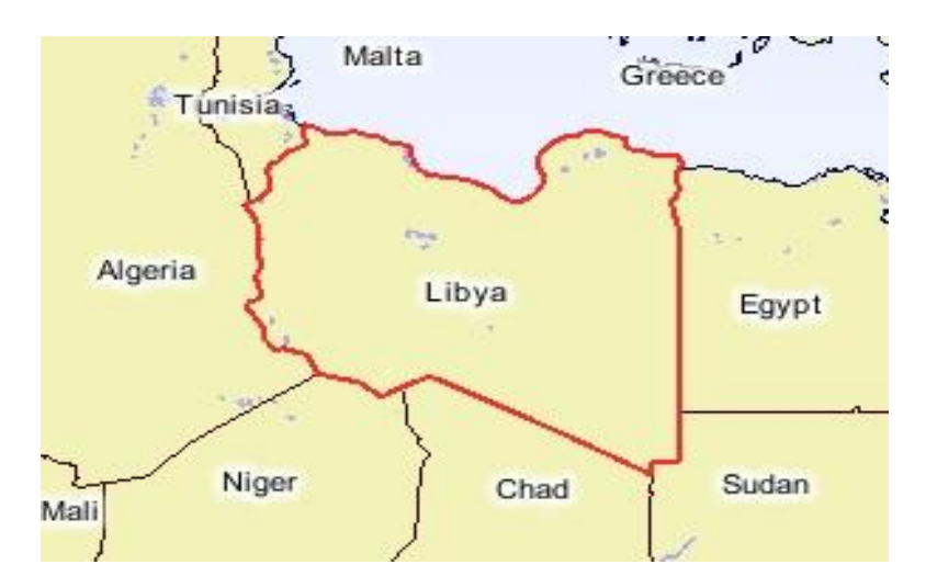
Fig.2 Libya Country borders

Approximately 85 % of the total population lives in the coastal area particularly in the major cities such as Zawia, Gherian, Tripoli the capital, El-Khoms, Misrata, Sirte, Benghazi, El-Baida Derna and Tobruk. The remaining 15% live in the southern part of Libya in the desert in cities and towns such as Sebha. Ghadames, Jalo, Oujela, Kufra, Jufra and Hoon. The population density of Libya averaged to two inhabitants /km². However, some coastal cities are more densely populated than in the southern regions that have a population density less than one inhabitant / km².