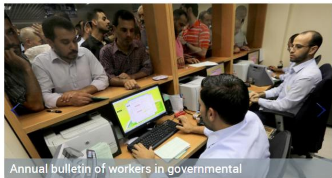
Annual bulletin of workers in governmental