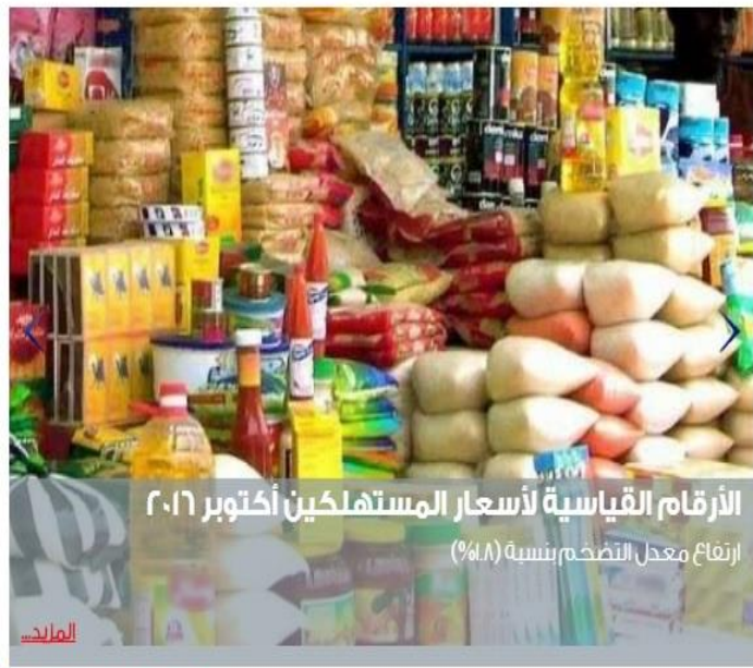
الأرقام القياسية لأسعار المستهلكين أكتوبر ٢٠١٦ ارتفاع معدل التضخم بنسبة (٠.٨%)