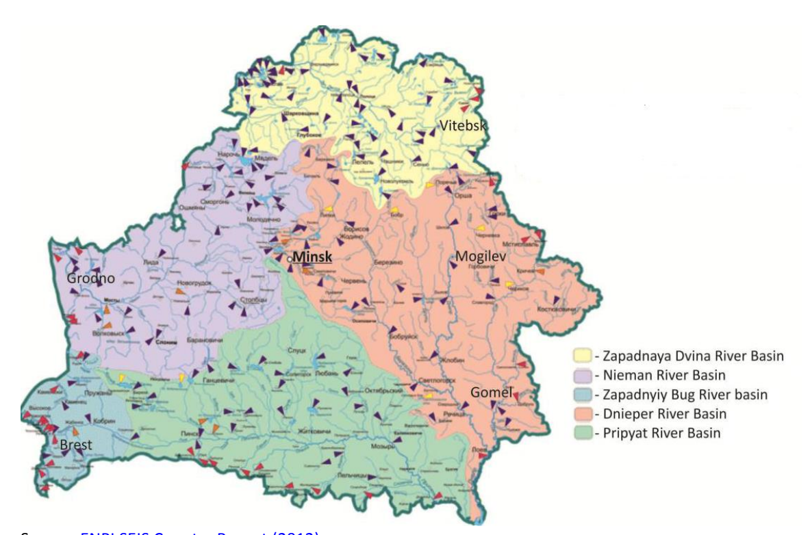
Figure 1: River basins of Belarus

Belarus has already delineated river basins. The country has five river basins i.e. Zapadnaya Dvina, Nieman, Zapadnyiy Bug, Dieper and Pripyat. All the basins are transboundary whereas Belarus is upstream of four river basins except Dvina (Figure 1).