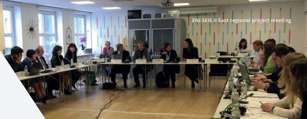
ENI SEIS II East regional project meeting

The main objective of the project is to continue to implement the principles and practices of the Shared Environmental Information System (SEIS). The project builds on previous cooperative activities in the six Eastern Partnership countries.