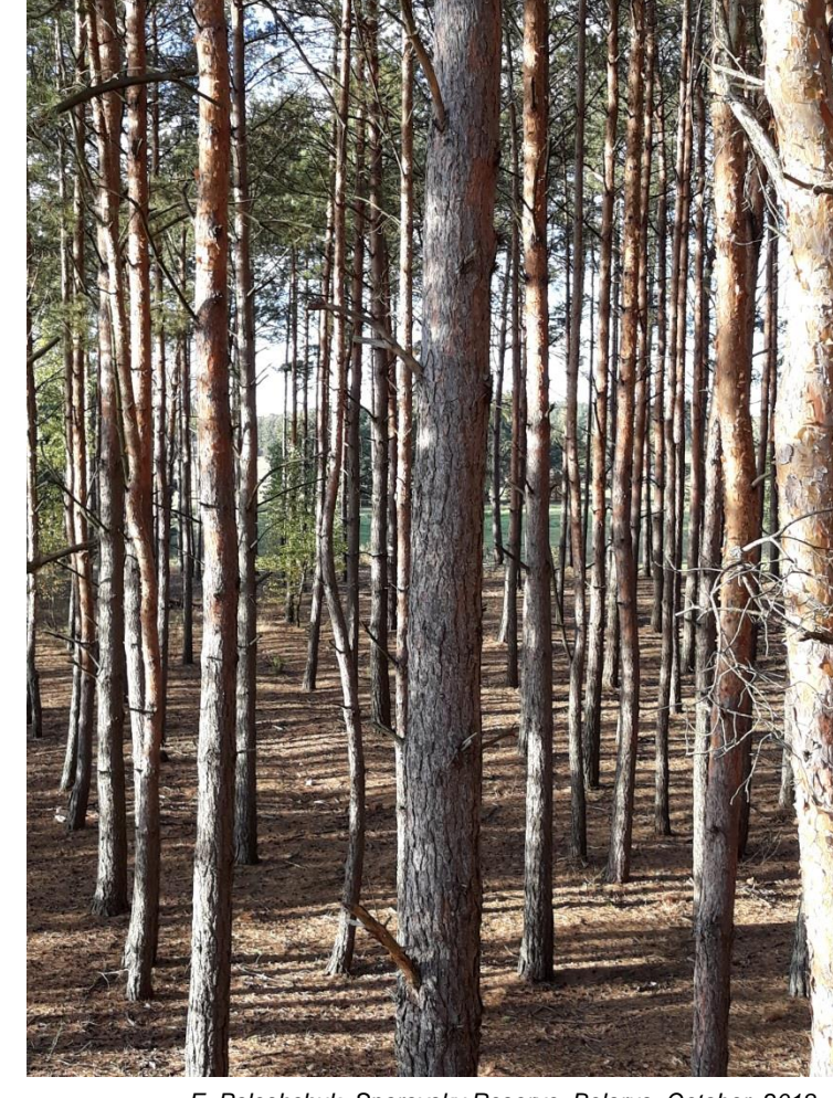
E. Poleshchuk, Sporovsky Reserve, Belarus, October, 2018