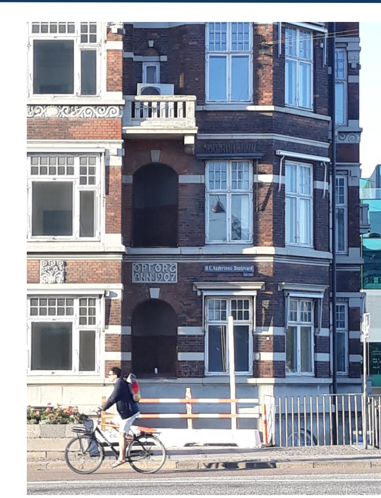
E. Poleshchuk, Copenhagen, June, 2018