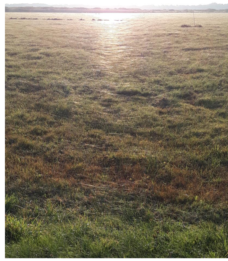
E. Poleshchuk, Sporovsky Reserve, Belarus, October, 2018